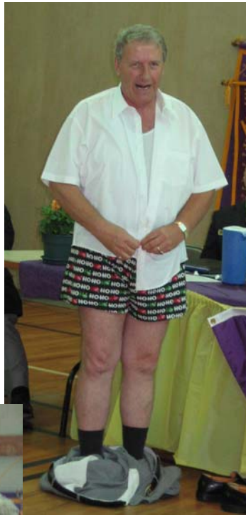
What a game guy!