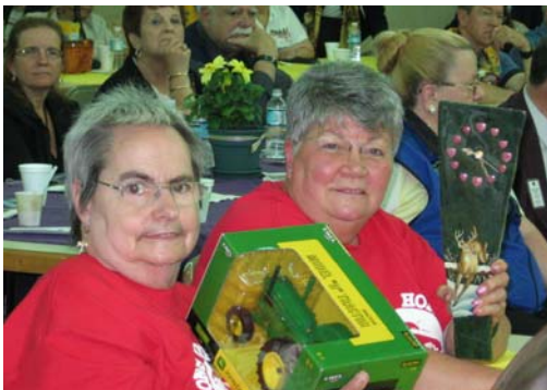
Two happy raffle winners!