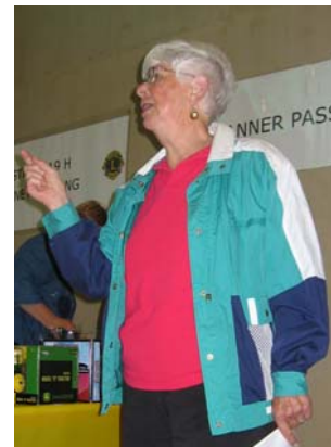
LCIF Chair encouraged clubs to remember their donations to LCIF.