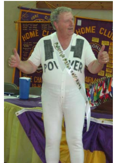
So, the man says, "I'm ready — bring it on!"