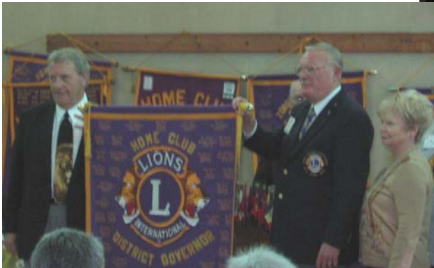
...and the banner is passed.